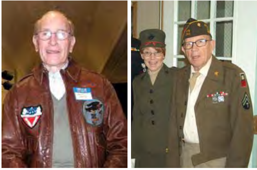
Our Heroes--Our Veterans!