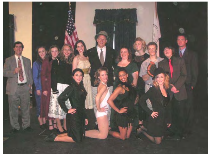
The USO Show Cast

Veterans, families and friends enjoyed the delightful show, displays and refreshments. Thanks to the very generous donations of our community, the event was a great success.